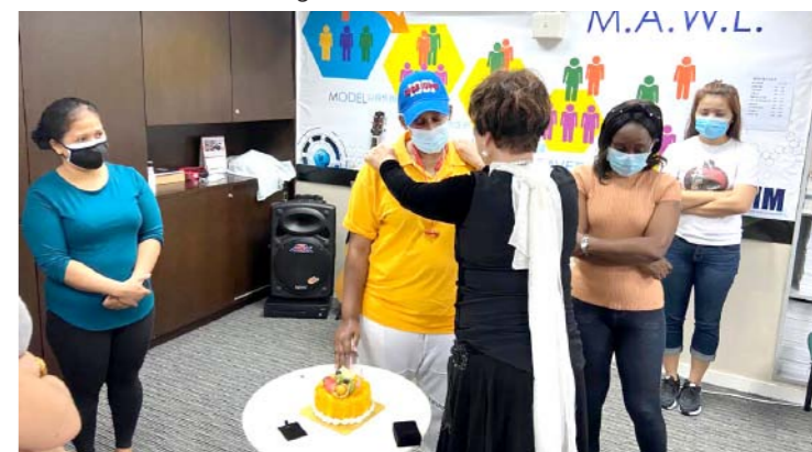
▲ 2020 Birthday Blessings! 生日贈送祈禱祝福一個!