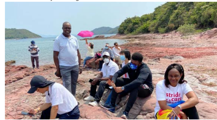
▲ 2021 Joining Mobile church 參與「動教會」 ▼ 2021 Stylish street evangelism 型住去街頭佈道