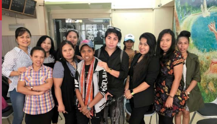
▲ 2012 Indonesian Zone established 印尼區成立

(MAY) Another service on Saturday night was established.