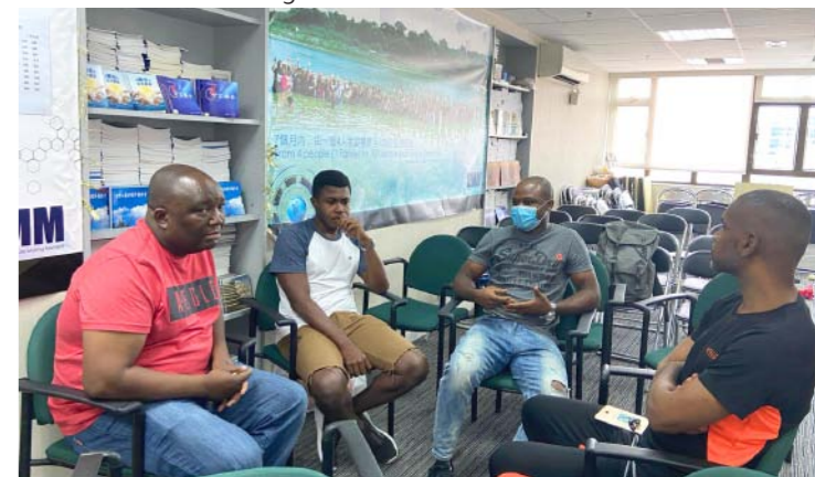
▲ 2020 DMM and training 小組培訓