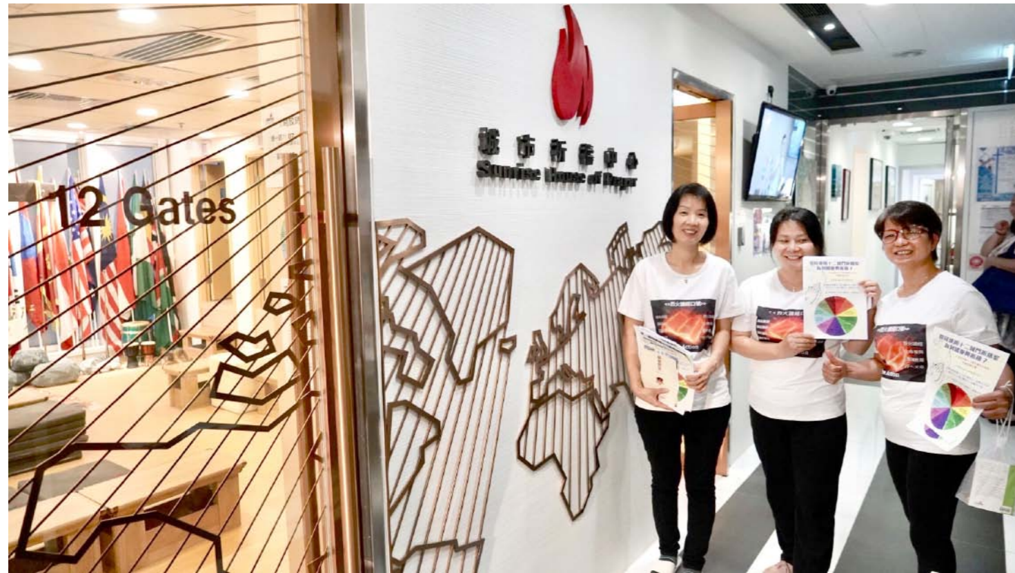
十二城門——成就耶穌的心願：萬國祈禱殿。The 12 Gates — Fulfill Jesus' wish: House of Prayer of All Nations.