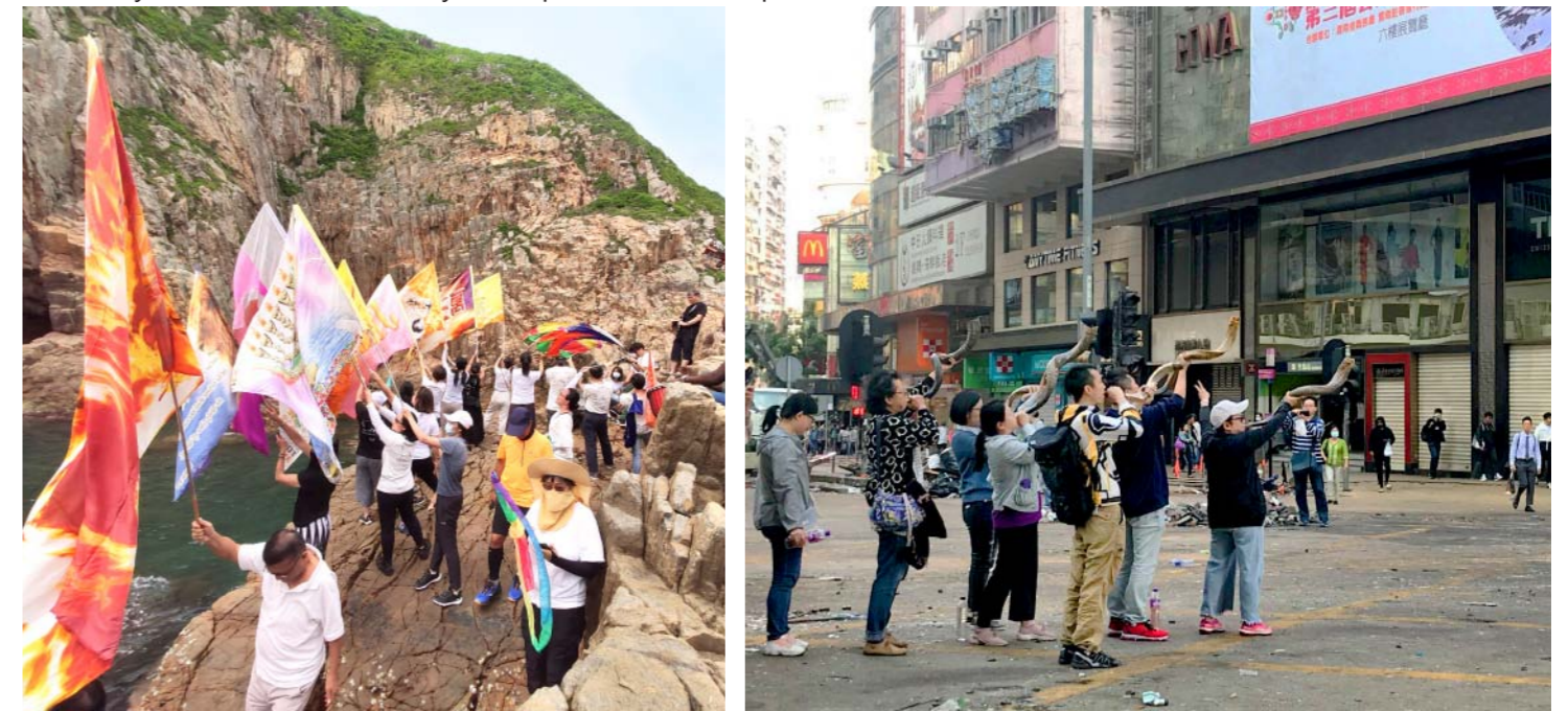
Joined hands with Jubilee Ministries and Kingdom Ministries to operate a place of prayer on a 24/7 basis