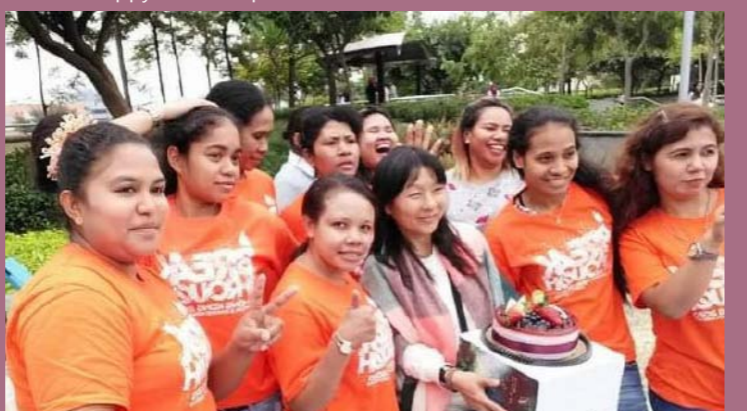
▲ 2017 Anniversary always have Birthday cake 教會堂慶一定有生日蛋糕