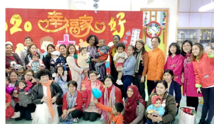
▲ 2020 Outreach visiting 外展探訪

(SEP) Three African brothers became our voluntary co-workers. Training on DMM and prayer, participating in Mobile Church and intercession prayers.