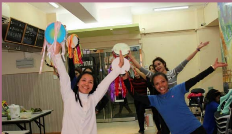
▲ 2015 Happy Fellowship at Lai Kee Mansion 在禮基的聚會超開心